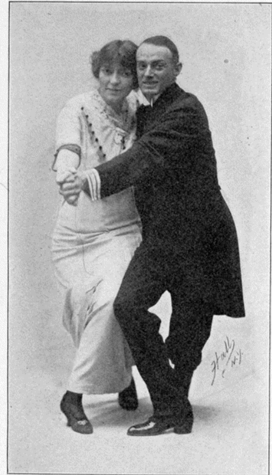
Showing a movement that may be introduced in the Tango, the twisting and bending of the knees being made in time to the music.