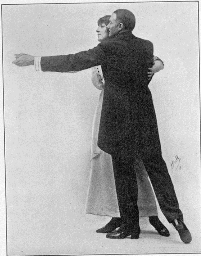
In no position of the entire dance is the lady held tightly.