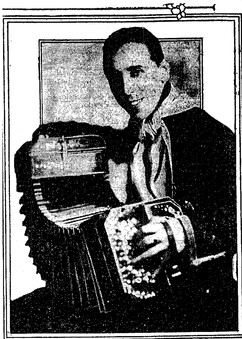
Oswaldo Fresedo Will Lead His Los Argentinos Orchestra on WJZ's Network Thursday Night at 9 o'Clock.