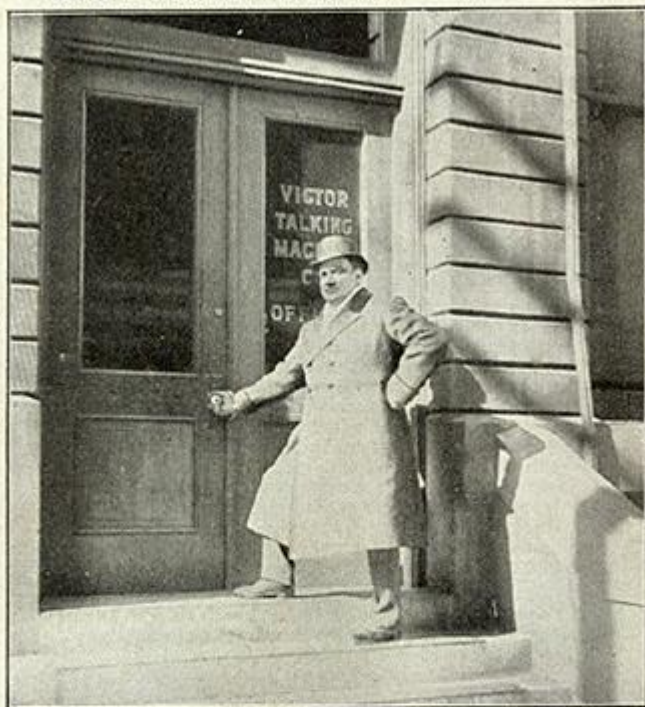
Caruso entering the Victor Laboratory at Camden, Nov. 5th, to make his new records

(Issued as a special addition to the December Supplement)