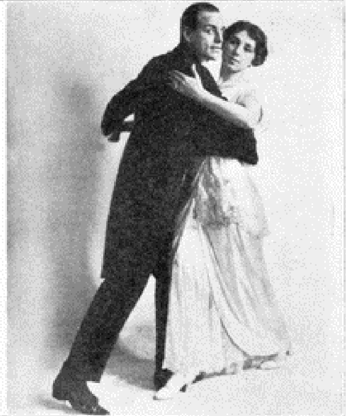
FIG. 2.—In position for the first step of the Tango. The gentleman's left arm, as seen in photo., is outstretched, but is bent at the elbow, and the lady's right arm is also bent, the forearm being almost perpendicular.