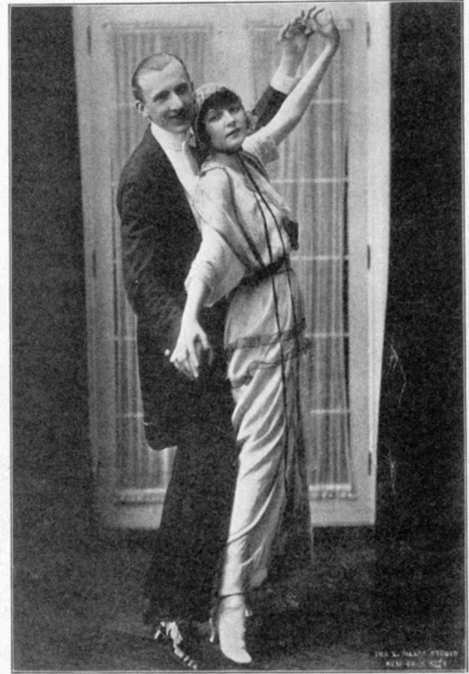
MR. AND MRS. VERNON CASTLE The most noted exponents of modern dancing.